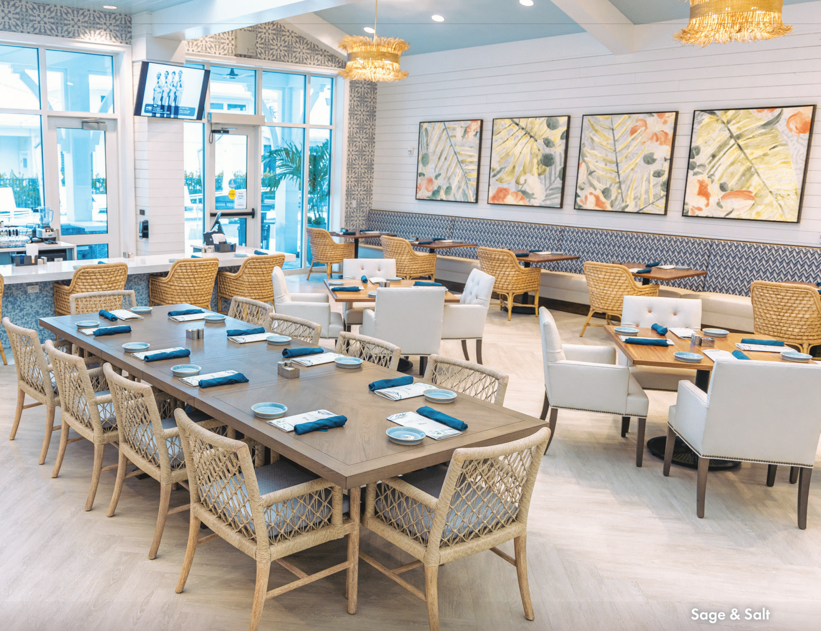
Sage & Salt